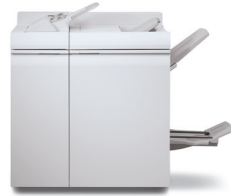
Multifunction Finisher Pro Plus