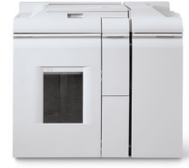
Basic Finisher Module – Direct Connect