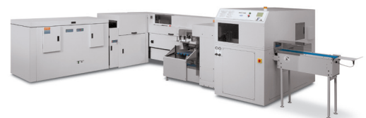
Xerox® Book Factory