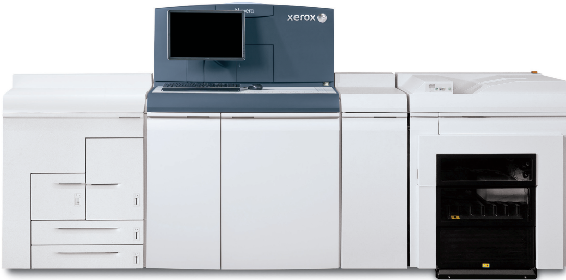
Xerox Nuvera® 157 EA Production System with Xerox® Production Stacker