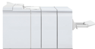
Plockmatic Pro 30/50 Booklet Maker (Available on 100/120/144/157 only)