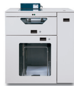
C.P. Bourg BSFx Dual Mode Sheet Feeder