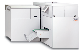
Watkiss PowerSquare 200