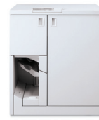
Xerox® Tape Binder