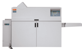
C.P. Bourg BDFNx Booklet Maker with Square Edge