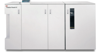
GBC FusionPunch II with Offset Stacker