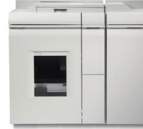
Basic Finisher Module Plus