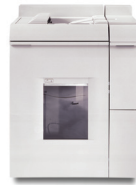
Basic Finisher Module