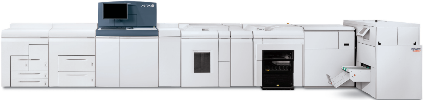
Xerox Nuvera® 157 EA Production System with Xerox® Production Stacker and Watkiss PowerSquare 200