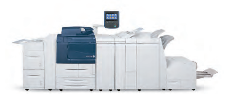
Xerox® D136 Copier/Printer shown with optional 2-Tray High-Capacity Feeder, Standard Finisher, Folder and Post Process Inserter.

Innovative production solutions to ensure a greener today and tomorrow.