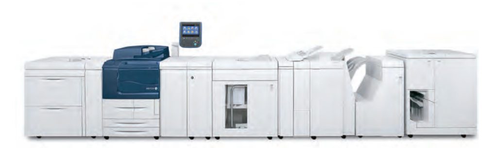
Xerox<sup>®</sup> D136 Copier/Printer shown with 2-Tray Oversized High-Capacity Feeder, GBC<sup>®</sup> AdvancedPunch™, High-Capacity Stacker, Standard Finisher Plus, Booklet Maker Finisher, Post Process Inserter and Tape Binder.